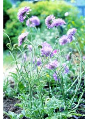
Blue Pincushion Flower